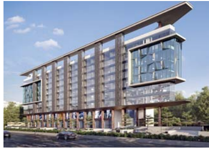
58. AEKUM HUB The Ultimate Business Hub which Blends Luxury, Tradition, & Innovation