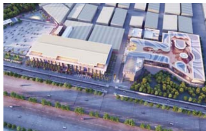
62. Bhumi World Factory Outlet Mall All Set to Redefine Indian Retail Landscape