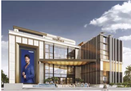
50. Aarize Group Crafting the Future of Luxury Realty with Vision and Excellence