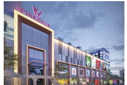
68. Pinkwalk Rajasthan's Largest Retail & Lifestyle Destination