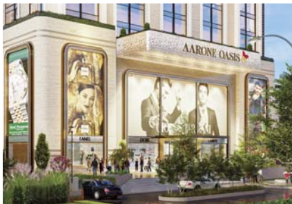
52. Aarone Oasis Dehradun's Upcoming Lifestyle Landmark Blending Nature, Retail & Hospitality