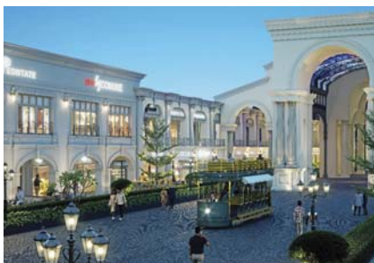
55. Blessing Luxuria An Iconic High Street Development Which is Built for Legacy