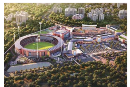
71. The Omaxe State India's First Integrated 5-in-1 Retail & Sporting Arena