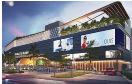
60. Bailey Square Shaping Patna's New Retail & Lifestyle Core