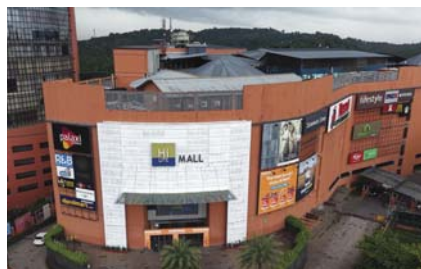
64. HiLITE Group Creating Experiential Centres for the Community