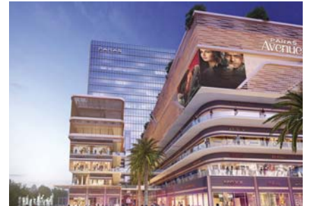
66. Paras Avenue Redefining Retail at 129 Noida Expressway