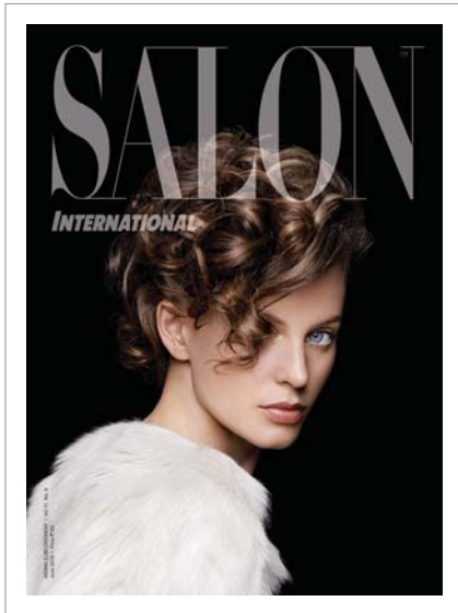
Hair: Jean Louis David