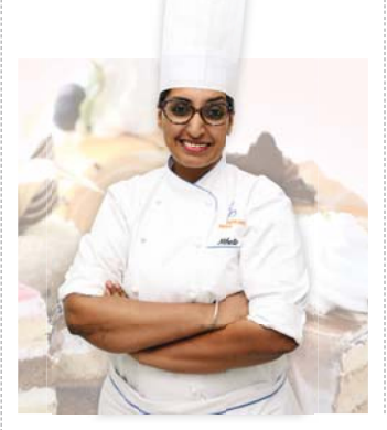
34 .... QSR

How pastry can find prominence as a popular dessert