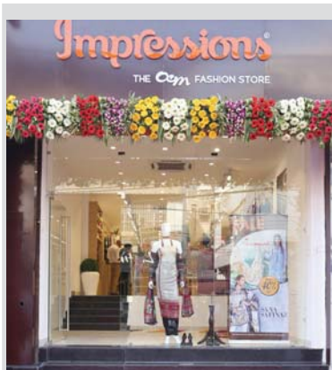
Impressions: The OCM Fashion Store Pg No. 52