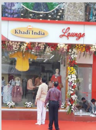
LAUNCH KVIC LAUNCHES ITS NEXT GEN RETAIL OUTLET

KVIC's Khadi Lounge showcases a designer line of garments and an exclusive range of handcrafted fabrics to cater to trend conscious men and women. Pg No. 54