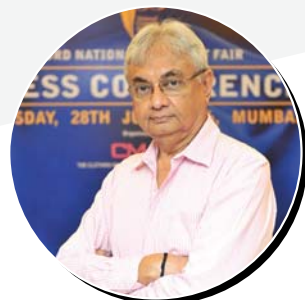
Pg No. 58

With the collaborative effort of Ministry of Textiles and Ministry of Consumer Affairs, Food and Public Distribution, loose ready-made garments have been exempted from Legal Metrology (packaged commodities) Act 2011.