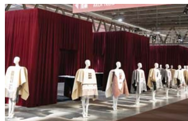
Pg No. 70

Women consumers control about USD 28 trillion in annual consumer spending. Diagonal Consulting (India) analyses the history and evolution of jeans as a modern dress habit for women.