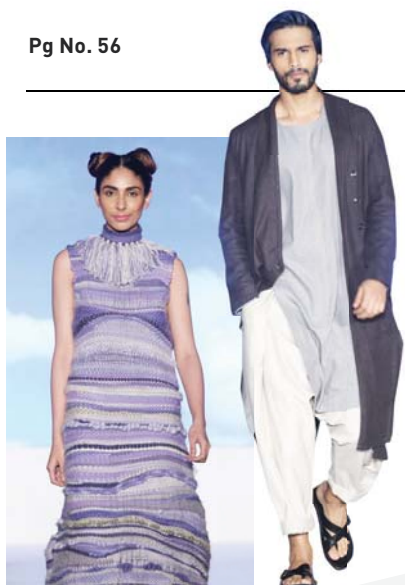
Pg No. 56

Highlighting the venerable talent of today's fashion design students and the versatility of Merino wool, the competition was a runaway success.