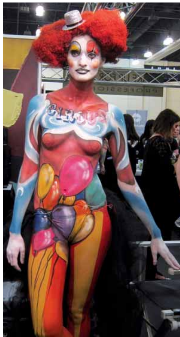
The extraordinary body painting artistry at IMATS

IMATS has grown over the years and so has the number of attendees. Los Angeles is the biggest show that has been attracting record-breaking crowds. IMATS continues to educate and connect make-up artists from around the world. The show is held six times annually — in London in January; New York in April; Los Angeles in June; Vancouver, BC in July; Sydney in September and Toronto in November. The exhibitors at IMATS LA included several renowned make-up brands such as, Bobbi Brown, Eye Candy Cosmetics, Inglot, Kevyn Aucoin, Kryolan Professional Make-up, MAC, Make-up Designory, Make Up For Ever, Mehron Inc, Naked Cosmetics, Napoleon Perdis, etc. Equipment companies including large ones such as, Royal & Langnickel, Crown Brush, Dinair Airbrush