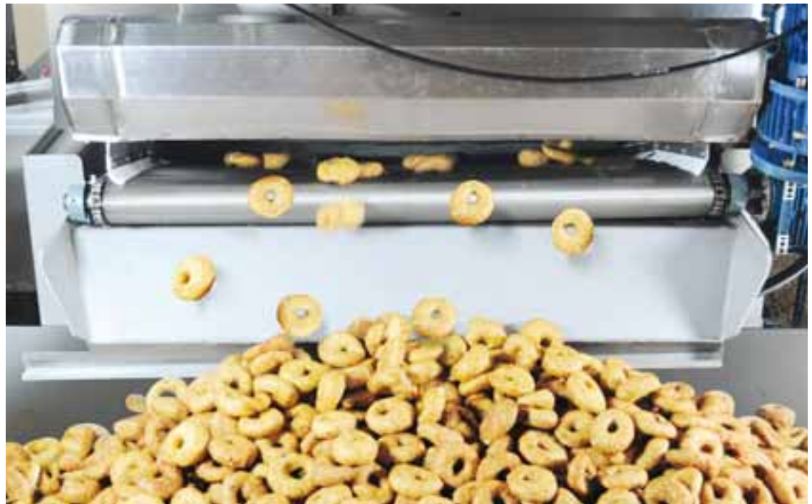
▼ The Rs 70 crore company hopes to reach Rs100 cr this fiscal, and Rs 200 crore next year

We have a 28,000 sqft factory with separate units for each product category. Our manufacturing capacity is up to 700 crores. Currently, we are a Rs 70 crore company, and we hope to reach Rs100 cr this fiscal, and Rs 200 crore next year. When we started operations in 2010-11, our total turnover was Rs 3 crore, so it definitely has been a steep climb.