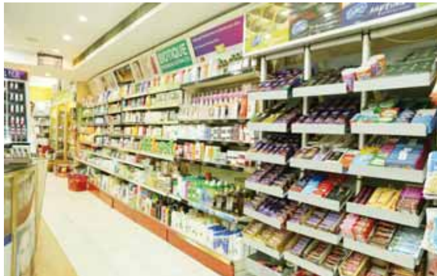
▼ Empire Stores makes constant innovations in modernising its trade practices, improving retail techniques, and enhancing its product offerings