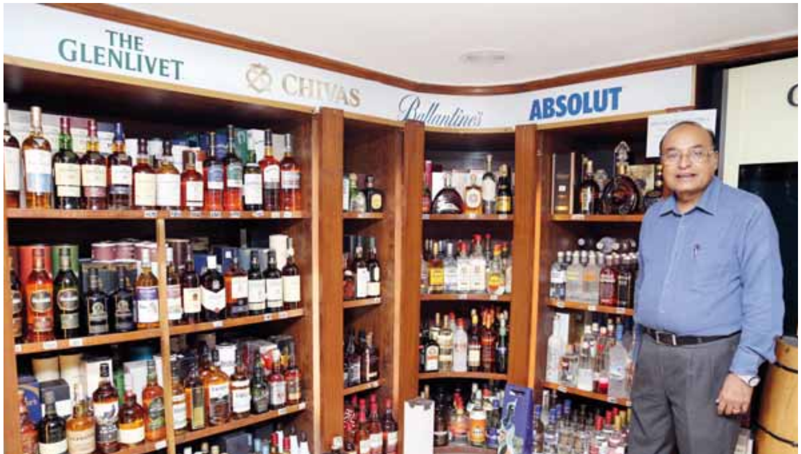
▲ Subhash Gulati at Empire Stores' Wine and Liquor section