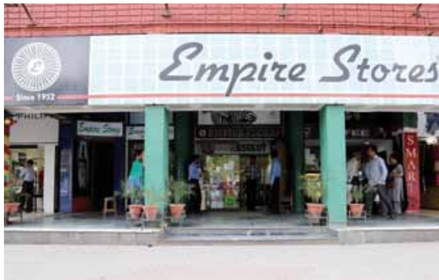
▲ From the initial 2,200 sqft to 3,000 sqft, and plans to expand to 7,000 sqft, Empire Stores is set to grow, following which, it will introduce more household items and lifestyle products