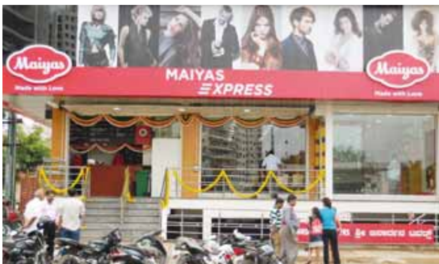
▲ Maiyas has become a landmark, and its stores are visited by around 8,000 people in a day

The north-east is a very large market for us, especially for our beverages, sweets and snacks. The only problem is there is no proper distribution channel in the region, so we follow the CNF model for redistributing our products. In the other regions we have our own sales force and offices in Tamil Nadu, Kerala, Calcutta, Andhra Pradesh, Guwahati, Delhi and Mumbai.