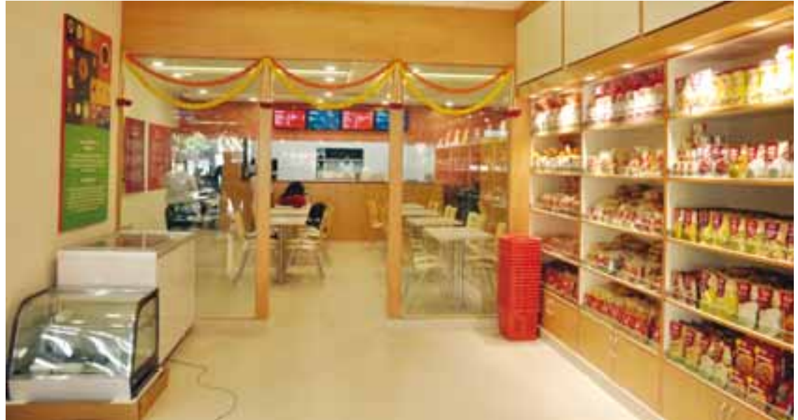
▲ Maiyas stores are part retail and part restaurant, measuring 1,500 to 2,000 sqft, with over 300 skus

What's more, we offer the same products across all regions, and they are truly authentic products. We do not believe in tailoring the products to suit any particular region; we are making the products the way south Indians enjoy them and this has been our USP, and it differentiates us from the competition.