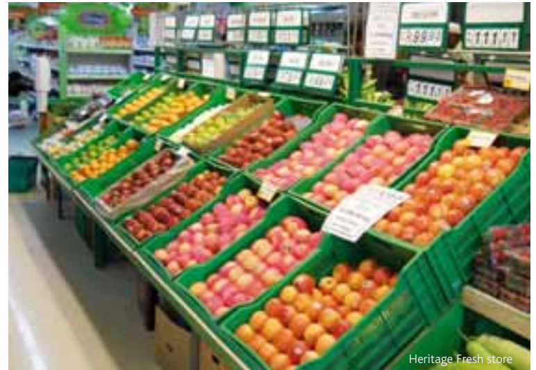
Heritage Fresh store