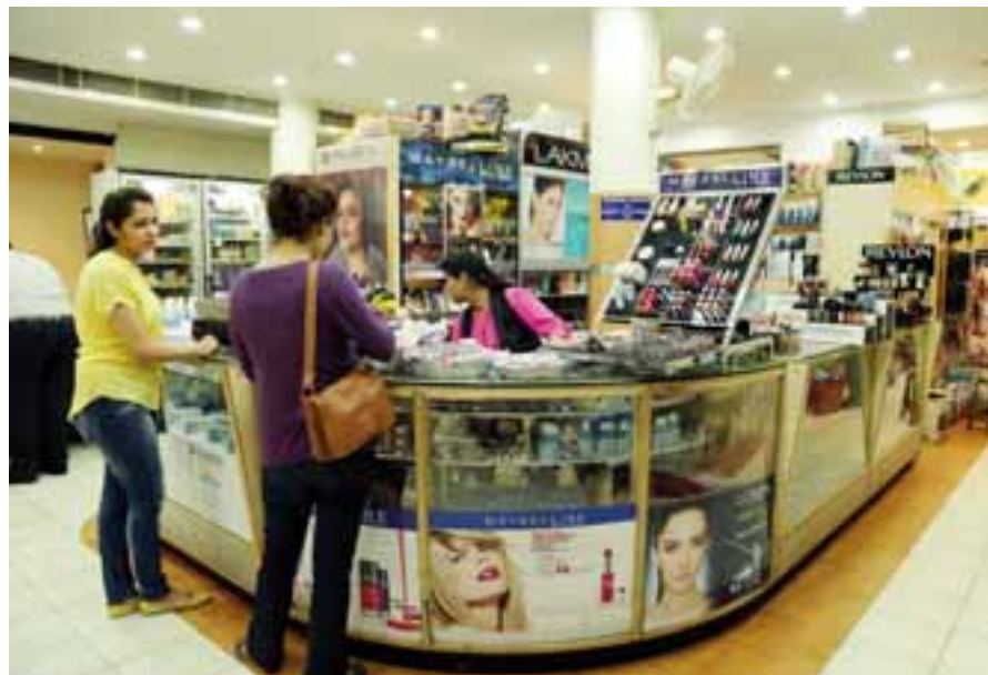
▲ Cosmetics from Chambor, Loreal, Maybelline, Revlon, Lakme, Ponds, Olay, Lotus and other renowned brands on display

Empire Stores stocks both food and non food products of known national and international brands. The food categories include Groceries, Beverages (alcoholic, non alcoholic, fruit juices, tea, coffee), Bakery & Confectionery (breads, biscuits, chocolates, snacks), Dairy Products (specialty cheeses, dairy spreads, mayonnaise, baby foods), Processed Foods (jams and spreads, syrups and sauces, condiments, yeast extract, peanut butter, canned vegetables, breakfast cereals, pasta, flaxseed oil, olive oil, prunes, vinegar, etc) and Health Foods. It also offers homemade chocolates that are exclusively made for the store, which also boasts of its own bakery for manufacturing breads and regular and sugar free cakes. Under the non food category, the store sells cosmetics, personal care, kitchenware, plasticware, and miscellaneous household goods.