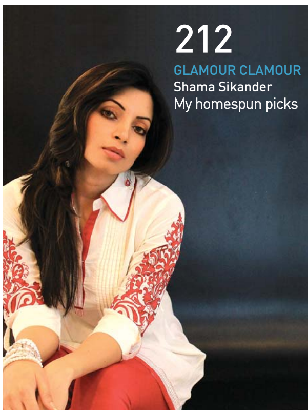
212 GLAMOUR CLAMOUR Shama Sikander My homespun picks