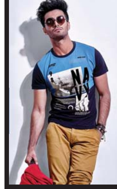
COVER COURTESY: STATUS QUO