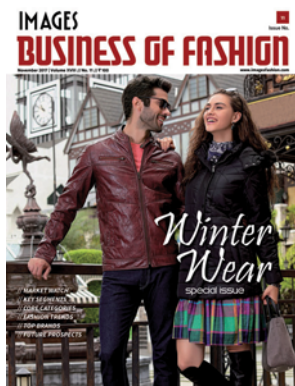
Cover Picture Courtesy:Lure