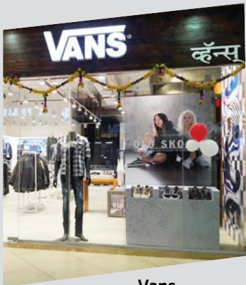
Vans Pg No. 38