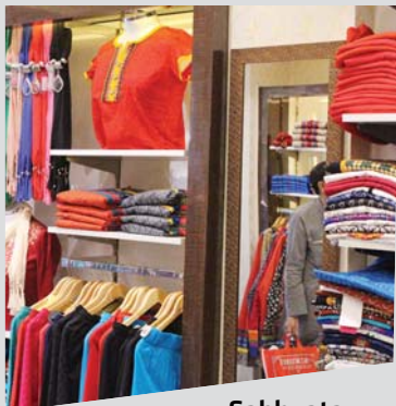
Sabhyata Pg No. 36