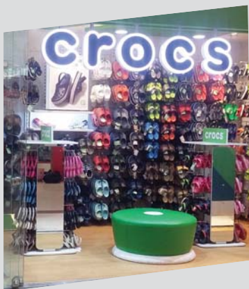
Crocs Pg No. 40