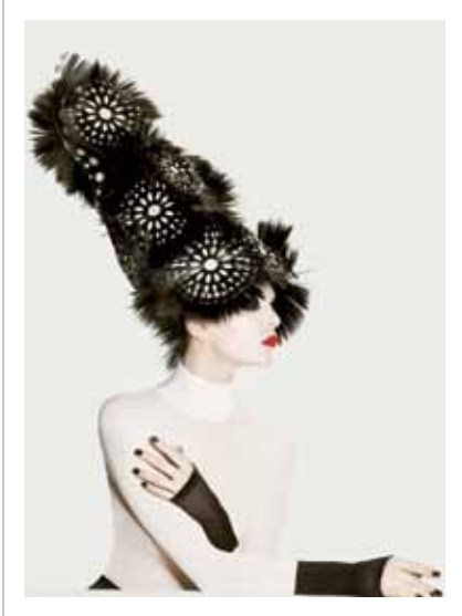
Hair: Nicholas French