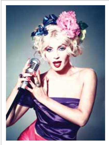
Iryna Bilyk